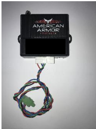
Ranch Code Receiver pre-wired with circuit board plug