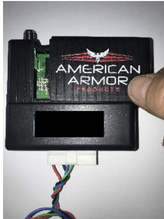
Remove cover by sliding dip switch access door to the right