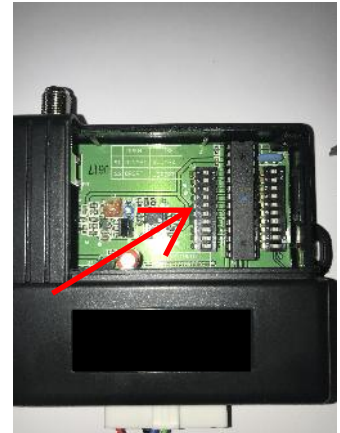
Set dip switch code on left to match transmitter