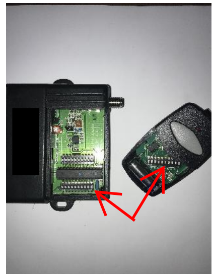
Set dip switch code on receiver to match transmitter and replace covers