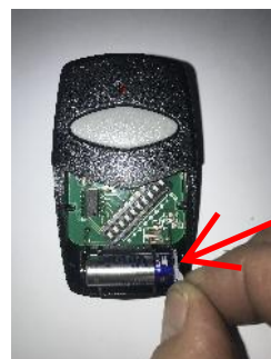
Remove battery saver tab