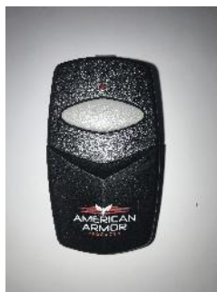
Ranch Code Transmitter Part # RCT