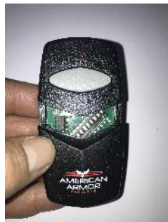
Slide dip switch cover down sets switch code